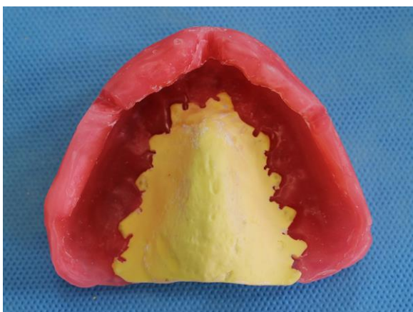
Fig. 3: Wax-resin record base was made to overcome the limited space

In addition, maxillary tuberosity was very close to the mandible in the rest position (Fig. 1). A panoramic radiograph revealed maxillary ridge and tuberosity prominences with pneumatized sinuses (Fig. 2). Primary impressions were made using irreversible hydrocolloid material (Chromogel; Marlic Medical Industries Co., Tehran, Iran). The impressions were poured using type IV dental stone (GC Fuji Rock; GC Corporation, Tokyo, Japan). An acrylic resin record with wax rim bases could not be made for the maxillary arch due to extreme limitation of the interarch space. Thus, a combined acrylic-wax record base was fabricated to ensure sufficient strength and rigidity. The acrylic resin base was cut from all areas except the palate. Then, the modeling wax (Cavex, Haarlem, Netherlands) was adjusted along the residual ridge down to the vestibular areas (Fig. 3).