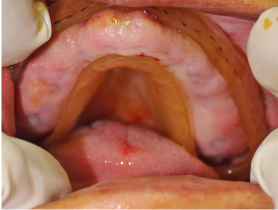
Fig. 5: The first surgical guide in place