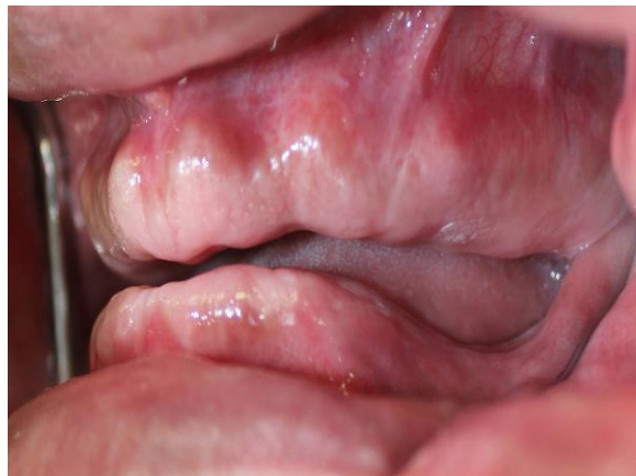
Fig. 1: Amount of interarch space in rest position