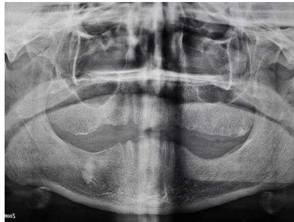
Fig. 2: Panoramic view of patient reveals the amount of bone in maxillary tuberosity