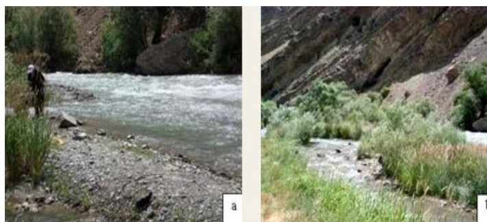
Figure 1. (a, b) Two sampling sites, Karaj River

The identified species are listed in Table 1. Also the captured nymphs of Plecoptera and Ephemeroptera are shown in figures 3 and 4, respectively. Figures 2 and 5 show Trichopteran eggs, larvae and case.