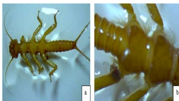
Figure 3. Plecoptera: (a) Nymph. (b) Lateral gills on thoracic segments