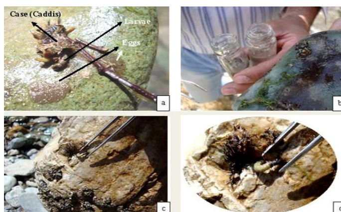
Figure 2. (a) Trichopteran larva, case and eggs. (b, c, d) Bring out and pick up the larvae with forceps