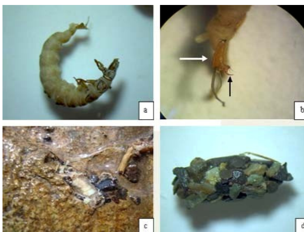
Figure 5. Trichoptera: (a) larvae. (b) Anal proleg and claw. (c, d) Pupal cases