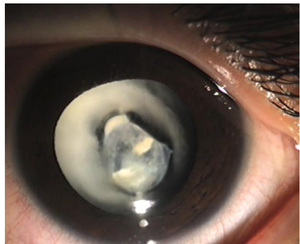
Figure 2. The left eye with partial resorption of membranous cataract